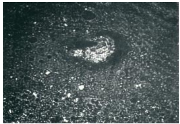
Fig. b: Soot particles in rubber. Interference fringes round the inclusion show that the rubber has undergone mechanical change here. Frequency: 400 MHz Image width: 1mm